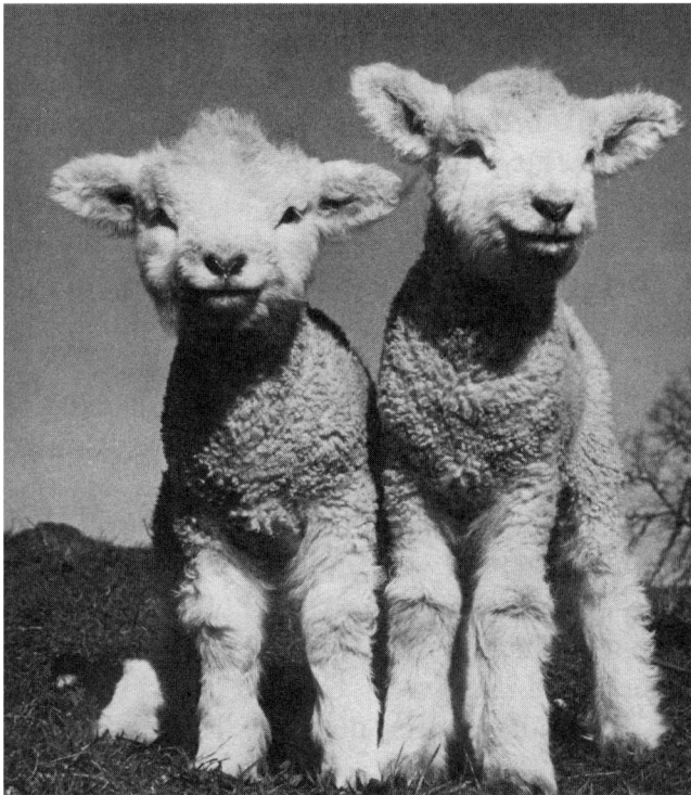
H. Armstrong Roberts

But each time, Pharaoh refused to free the children of Israel. One by one the plagues afflicted Egypt. Each plague brought greater destruction than the one before. Egypt was quickly becoming a ruined nation.