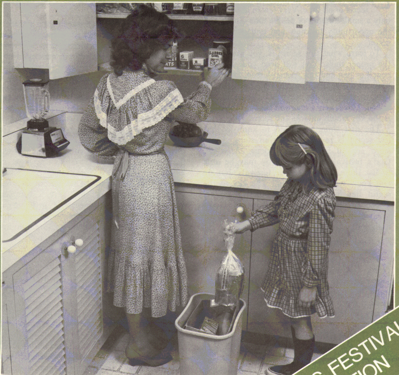
The Spring Feasts