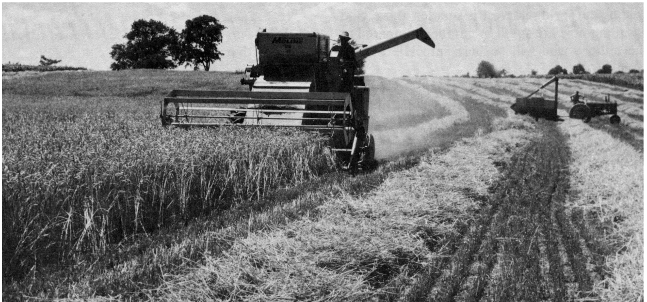
The grain harvest pictures the future spiritual harvest of human beings born into the God Family.

The word Pentecost means "fiftieth (day)." All other festivals come on definite days or