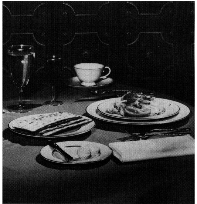
Unleavened bread, symbolic of the broken body of Christ. It is because of His brutal death that we can be healed.

A blemish is a flaw or fault. The "Lamb of God" was perfect—without sin or fault. The